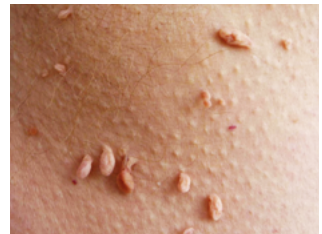
Skin tags or papillomas